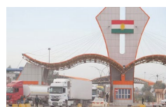
Ibrahim Khalil border (Türkiye-Iraq)