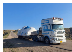
Transloading in north of Iraq